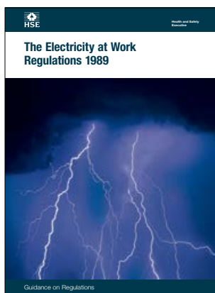
HSR25 (Third edition) Published 2015

This new edition of HSR25 will help dutyholders meet the requirements of the Electricity at Work Regulations 1989. It will be of interest and practical help to all dutyholders, particularly engineers (including those involved in the design, construction, operation or maintenance of electrical systems), technicians and their managers.